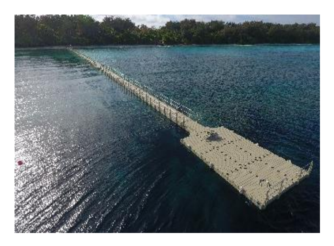
RotoDock HDPE pontoon modules create a robust, stable and versatile pontoon system that is virtually maintenance free.

RotoDock is easy to install and suitable for a wide range of applications from small private pontoons to commercial work platforms and full marina's