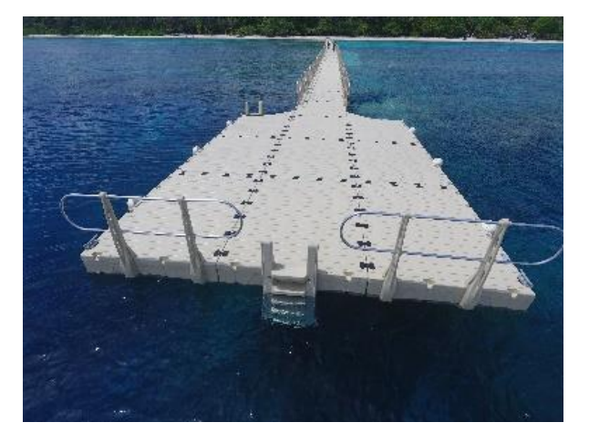
RotoDock modules are available in 4 standard sizes: 1.0 \,\mathrm{m} \times 1.5 \,\mathrm{m} , 1.0 \,\mathrm{m} \times 3.0 \,\mathrm{m} , 1.5 \,\mathrm{m} \times 3.0 \,\mathrm{m} , and 2.0 \,\mathrm{m} \times 3.0 \,\mathrm{m} allowing us to build pontoon systems in virtually any shape and size.

We stock an extensive range of mooring attachments to ensure that we provide the very best system for your location. These include anchor attachments, pile guides, stiff arms and heavy duty cleats.